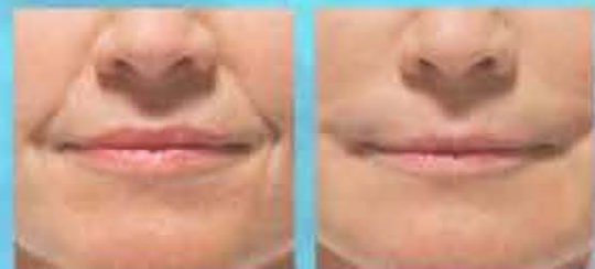
Marionette Lines / Nasolabial Folds