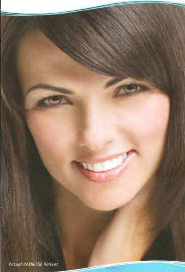
Actual RADIESSE Patient

INSTANT WRINKLE CORRECTION... THE MAGIC INGREDIENT IS YOU!™