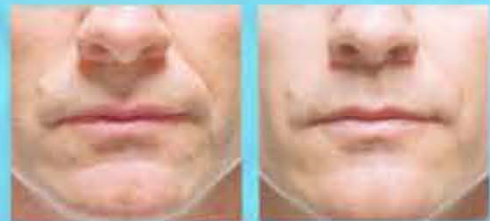
Nasolabial Folds - In Men